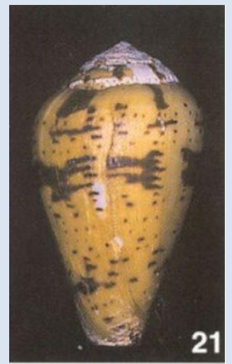
Santa Maria 32mm RR