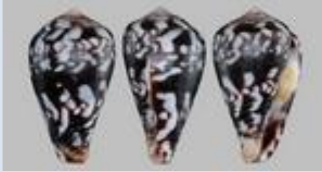
Santa Maria 13mm

Some fine specimens of Conus albuquerquei were circulated by Atoll Seashells (www.atollseashells.com).