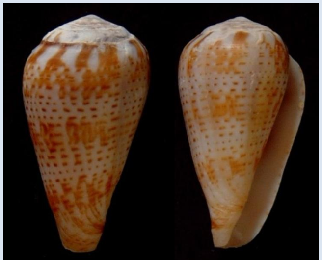
C aff. micropunctatus Santa Maria 27mm