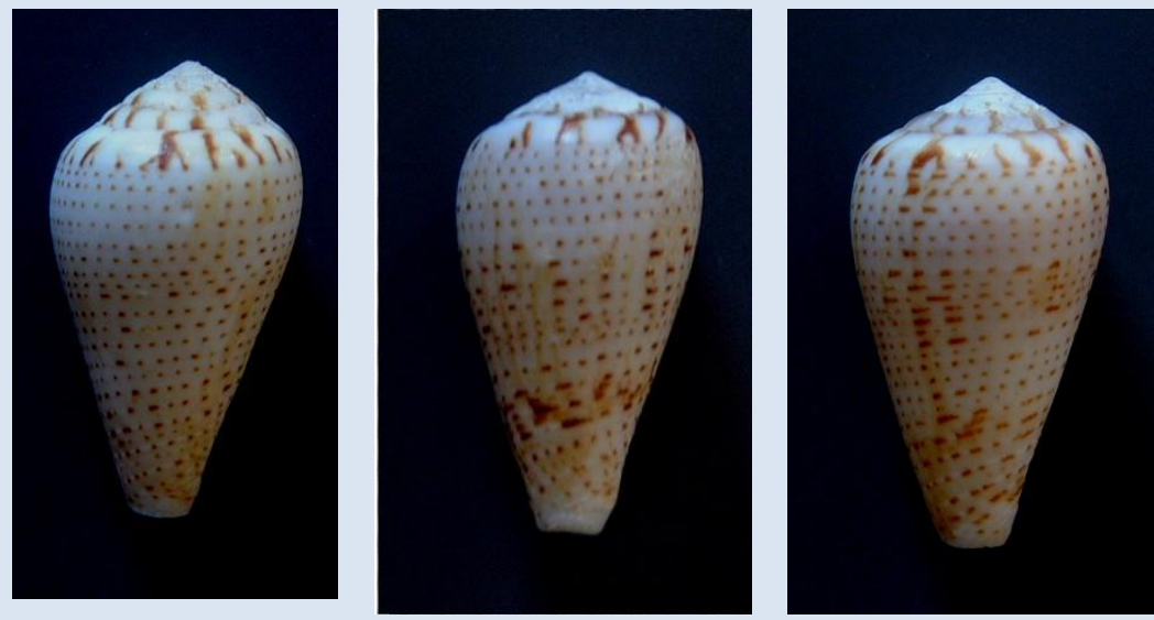
Santa Maria 26mm CS Santa Maria 24mm CS Santa Maria 26mm CS Other specimens(26mm) are much closer to C. lineopunctatus but have orange areas in their pattern. The areas can look as if some of their periostracum remains on the whorl surface.

"There are some Angolan Conus populations, which might be affiliated to C. micropunctatus with respect to their similar shell pattern. One of them, having a smaller size (L < 26 mm) and orange shade, could be an ecotype of C. naranjus or another valid species. Its punctated spiral lines are very dense and often fuse in continuous lines. We provisionally separate them from C. micropunctatus "