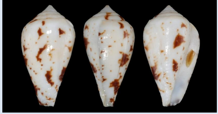
Santa Maria 17mm