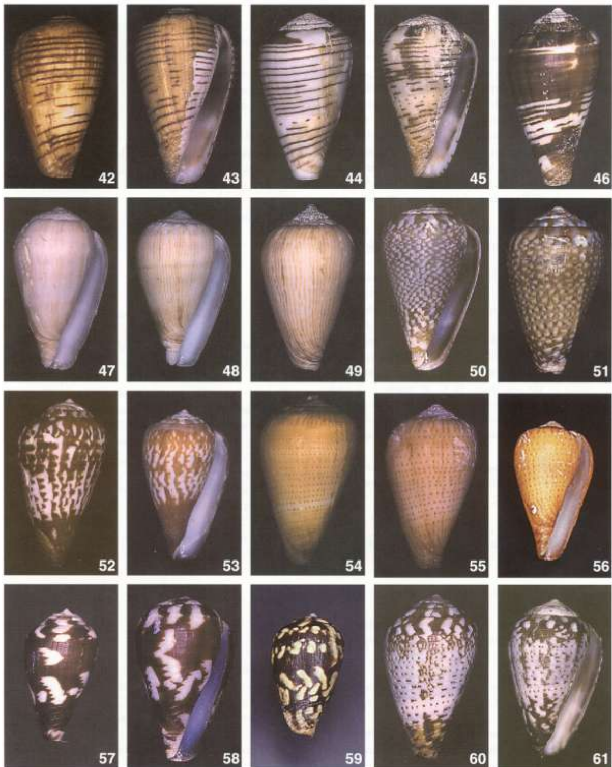
Figures 42-46. C. fuscolineatus . 42-43: holotype, 21.8 mm (BMNH); 44-46: Ponta de Noronha, 26.3, 22.7 and 20.7 mm (SMNS). Figures 47-49. C. cepasi . 47-49: Chapeu Armado, 39.2, 35.9 and 26.4 mm (SMNS). Figures 50-51. C. nobrei , 50-51: Lucira, 18.5 and 14.7 mm (CER). Figures 52-53. C. musivus : 52: Benguela, 22.7 mm (SMNS); 53: Lucira, 25.5 mm (CER). Figures 54-56. C. naranjus . 54-55: Santa Maria, 18.5 and 18.5 mm (SMNS); 56: Lucira, 15.3 mm (CER). Figures 57-59. C. albuquerquei . 57-58: Santa Maria, 17.0 and 15.2 mm (SMNS); 59: Santa Maria, 13.2 mm (CER). Figures 60-61. C. bocagei . 60-61: Lobito, 22.8, 26.0 mm (SMNS).