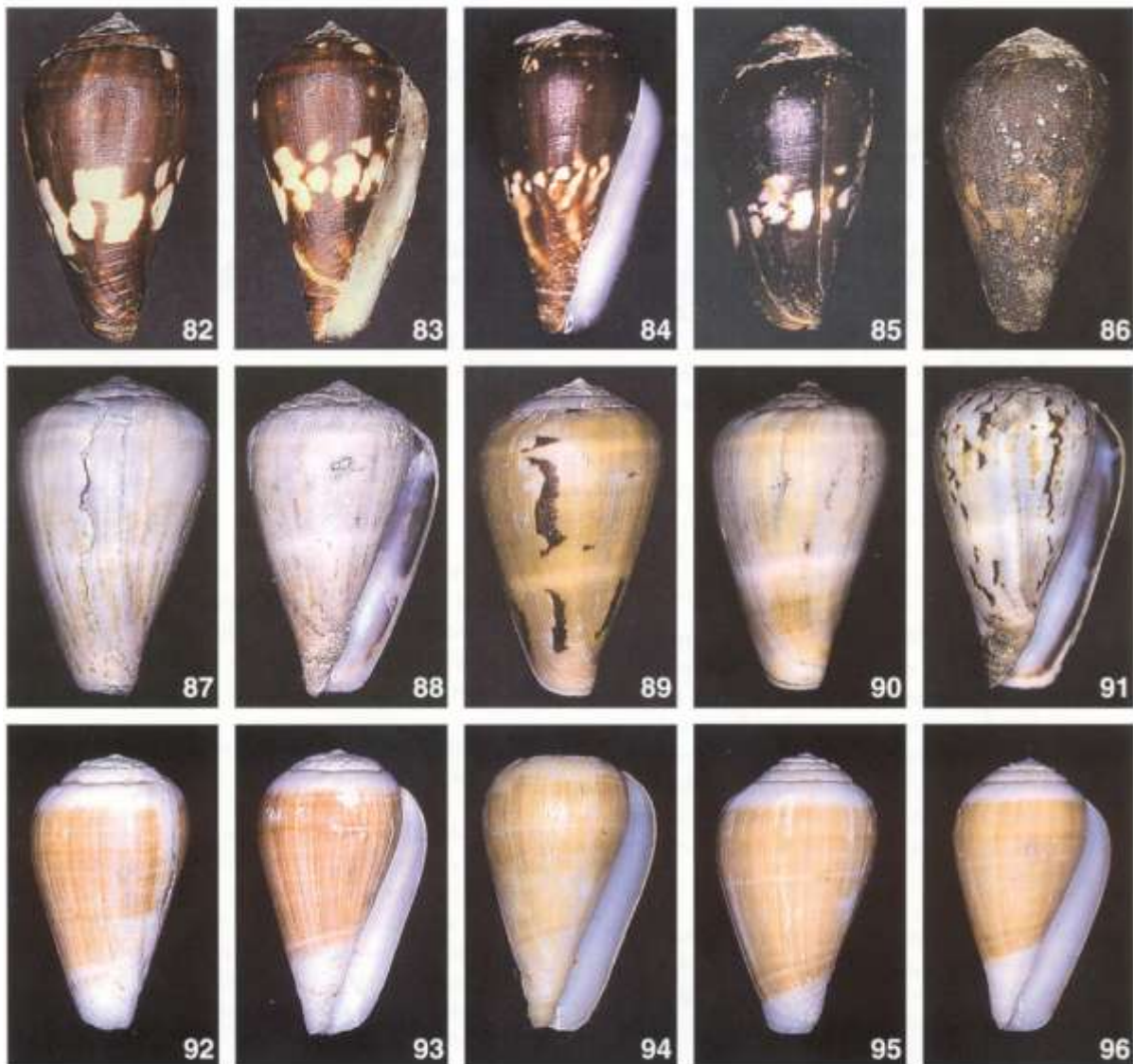
Figures 82-86. C. franciscoi n. sp. 82-83: holotype, Chapeu Armado, 28.4 mm (MNCN); 84-85: paratypes, Chapeu Armado, 34.8 and 36.4 (CER); 86: paratype, Chapeu Armado, 31.3 mm (MNHN), with periostracum. Figures 87-91. C. trouaoui n. sp. 87-88: holotype, Limagens, 38.5 (MNCN); 89-91: paratypes, Limagens, 37.3, 42.4 and 38.0 (SMNS). Figures 92-96. C. flavusalbus n. sp. 92-93: holotype, Baia das Pipas, 23.7 mm (MNCN); 94: paratype, Baia das Pipas, 25.9 mm (SMNS); 95-96: paratype, Baia das Pipas, 27.4 (SMNS).