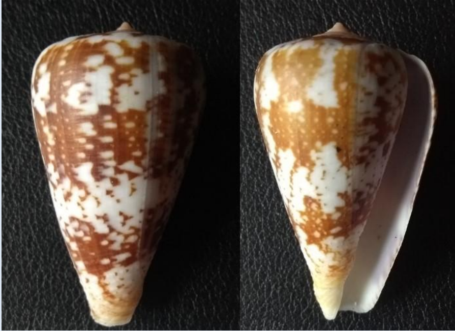
C.ermineus Limagens 49mm MJJ coll.