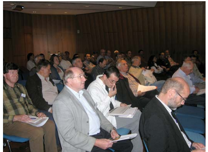
A view of the audience

Our goals for this meeting were multiple. We wanted to hear some of the top experts in the field speak about their research, we wanted to learn from them; we wanted to exchange information about Cones; we wanted to profit from the mini-bourse to get some new species for our collections; we wanted to meet people with similar interests. But above all that we wanted to spend a pleasant weekend and generally have a good time. And that we certainly did!