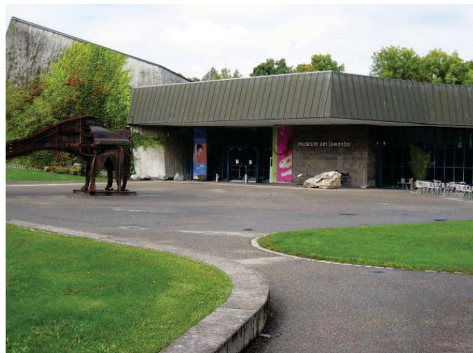
Entrance to the Museum